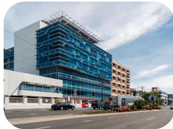
University Hospital Geelong